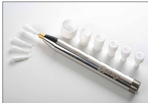
SD10 Open type cryoprobe (spray). This is only one in the world, patented, spray type cryosurgical probe with fluent, adjustable freezing power.