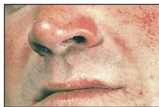
Keratoacanthoma of upper lip