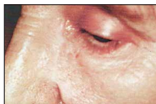
Epithelioma basocellulare of lower eyelid